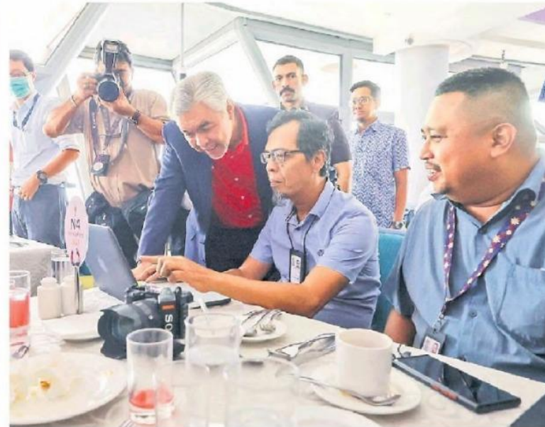
Ahmad Zahid takes an interest in a pressman at work on his laptop, during the gathering with media practitioners at Kuala Lumpur Tower.

On the gathering with the media, Ahmad Zahid said his ministry will take proactive measures to nurture ties between the ministry and media to expand the coverage of its